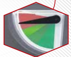
Indicator monitors and alerts when filter is dirty.