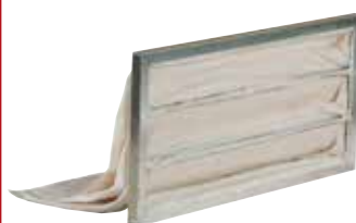
1-micron inner filter