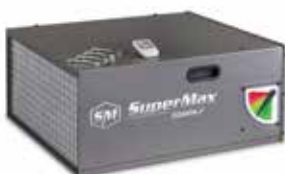
AIR FILTRATION UNIT