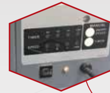
Timer settings from 1/2 hour to 4 hours.