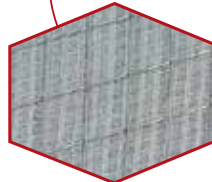
Includes outer washable electrostatic filter.