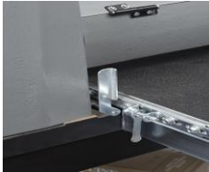
Lever to align stock

When sanding stock wider than 19", the simple index lever will properly adjust the conveyor for flawless wide sanding. No other sander on the market has this feature!