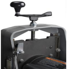
Ball bearing height adjustment

No other sander on the market has this feature!