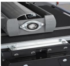
Extra wide conveyor table