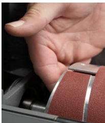
Take up fastener and easy access to abrasives

Other sanders may require a tool or helper.